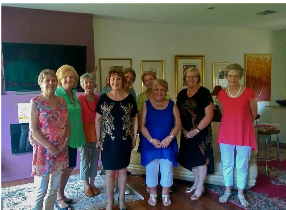
Planning Day January 2016