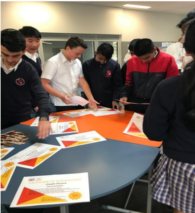
Year 9 students receiving certificates at the conclusion of the program