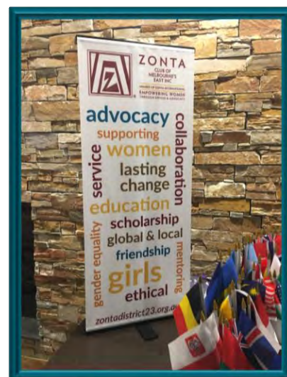
Our New Zonta Banner

Notices for our monthly club meetings featuring a guest speaker were regularly advertised in five local community newspapers, posted on social media and our Facebook page. These attracted many new guests to our club meetings.