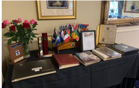
Display of Charter Certificate and Photo Albums