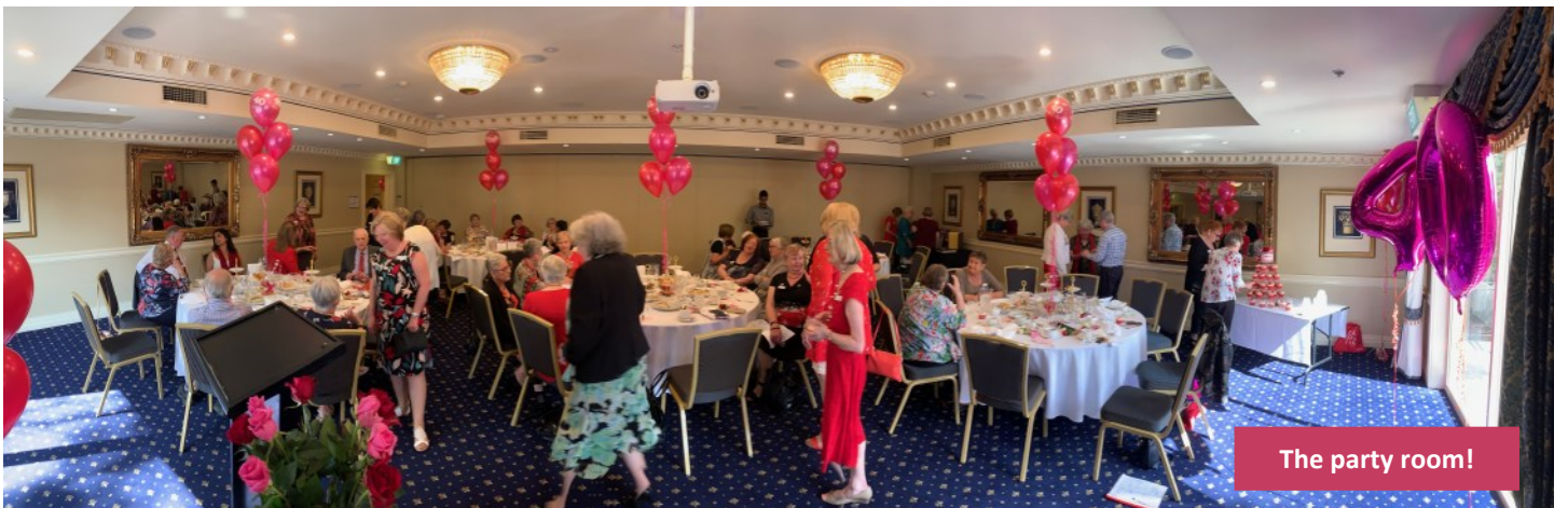
The party room!